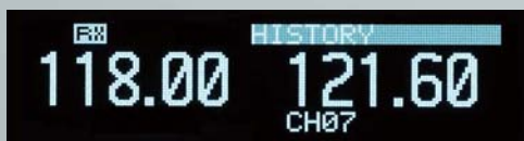
Operating information is clearly shown on the OLED display.

A fixed mount VHF airband first! The IC-A210 has an organic light emitting diode (OLED) display. The OLED display emits light by itself and the display offers many advantages in brightness, vividness, high contrast, wide viewing angle and response time compared to a conventional display. In addition, the auto dimmer function adjusts the display for optimum brightness at day or night.